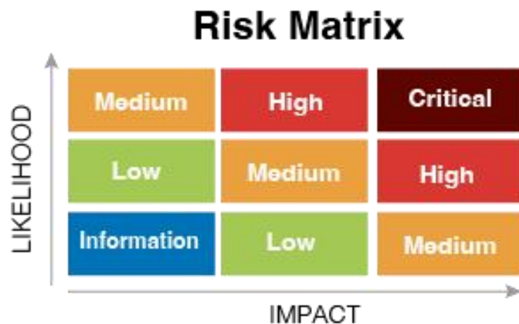
Table 1.1: Overall Risk Severity

To evaluate the risk, we will be going through a list of items, and each would be labelled with a severity category. The audit was performed with a systematic approach guided by a comprehensive assessment list carefully designed to identify known and impactful security issues. If our tool or analysis does not identify any issue, the contract can be considered safe regarding the assessed item. For any discovered issue, we might further deploy contracts on our private test environment and run tests to confirm the findings. If necessary, we would additionally build a PoC to demonstrate the possibility of exploitation. The concrete list of check items is shown in Table 1.2.